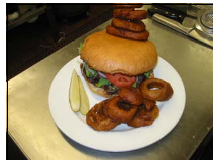
"The Sir Lawrence", Gotta see it and taste it to believe it!